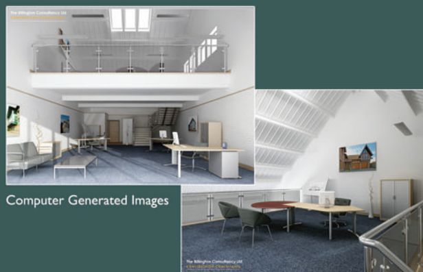
Computer Generated Images

A purchaser may wish to order additional items from the vendor, at an agreed additional price, such as: